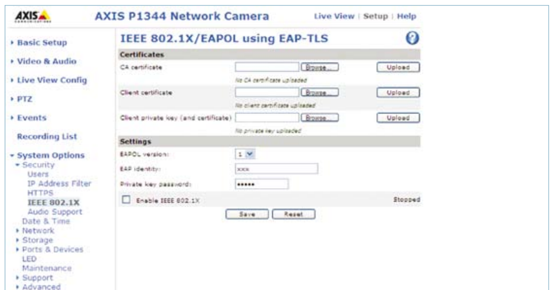
Figure 2. Web interface with AXIS P1344

There are many EAP methods available to gain access to a network. The one used by Axis is EAP-TLS (EAP-Transport Layer Security).